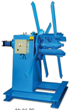
放料架 FEED PLATFORM